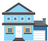
Household solar energy